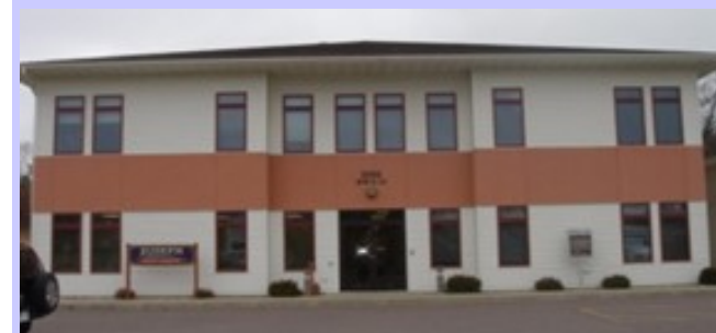
CWCAC Administrative Offices in Wisconsin Dells

CWCAC MANAGED INDEPENDENT LIVING APARTMENTS IN ADAMS BEAVER DAM FRIENDSHIP MAUSTON NECEDAH PORTAGE WYOCENA